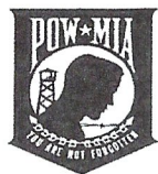
POW/MIA NEVER FORGOTTEN